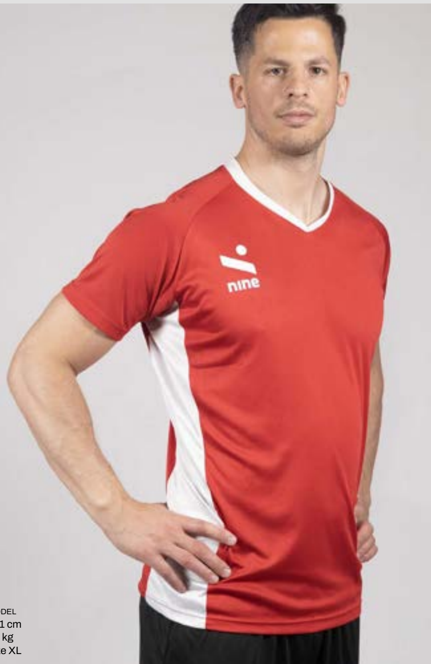
MODEL 191 cm 85 kg size XL