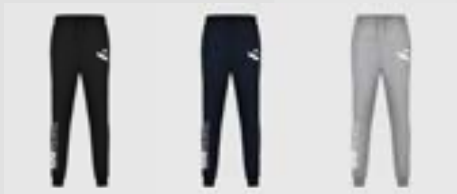
BLACK NAVY BLUE GRAY