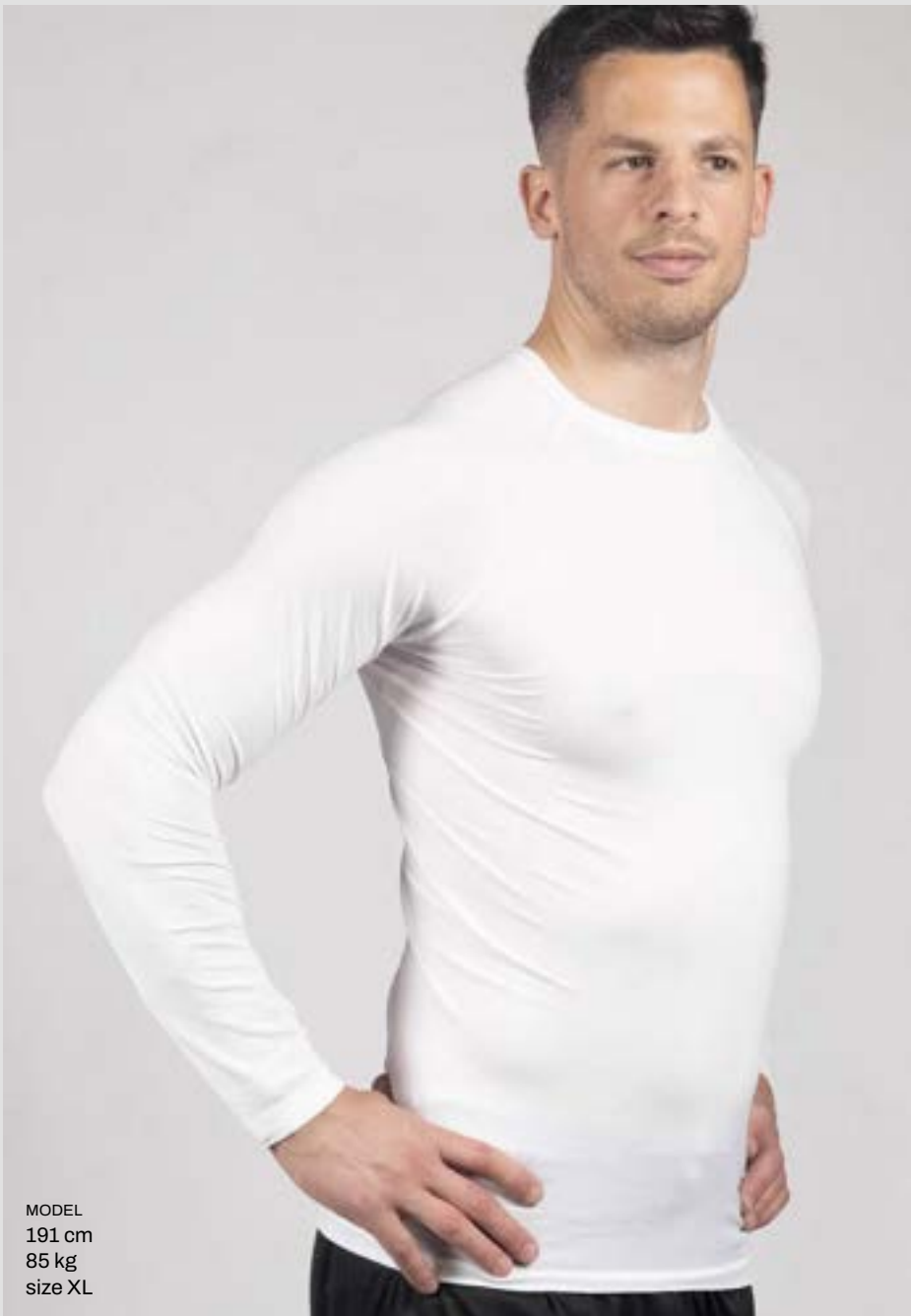
MODEL 191 cm 85 kg size XL