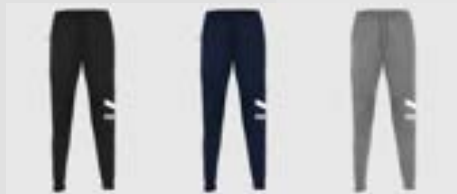
DARK GRAY NAVY BLUE LIGHT GRAY