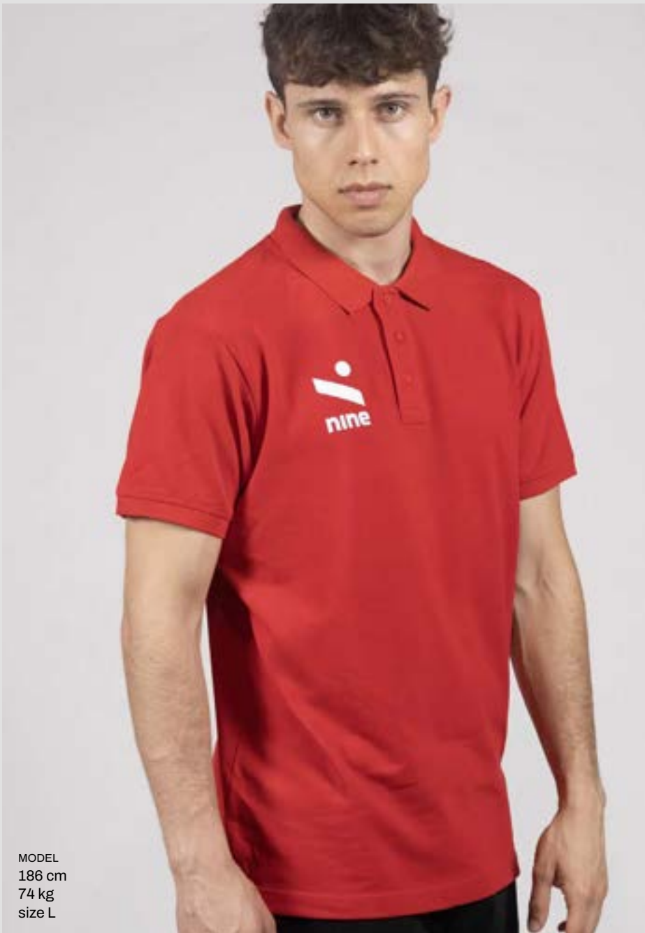
MODEL 186 cm 74 kg size L