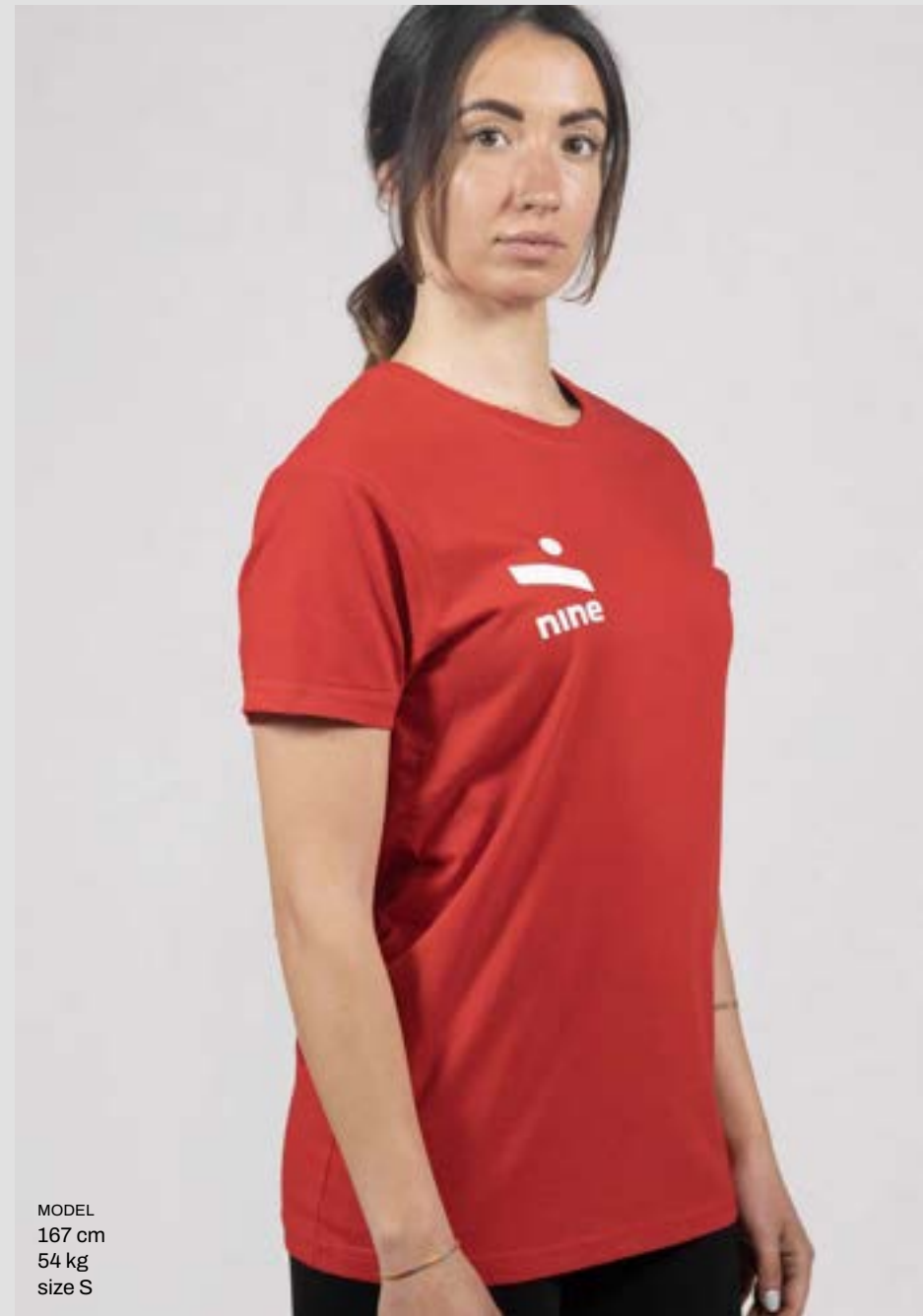
MODEL 167 cm 54 kg size S